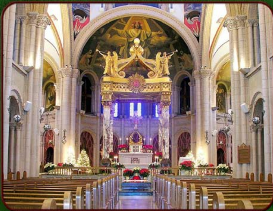
St. Francis of Assisi Church

"Glory to God in the highest, and on earth peace to those on whom his favor rests."