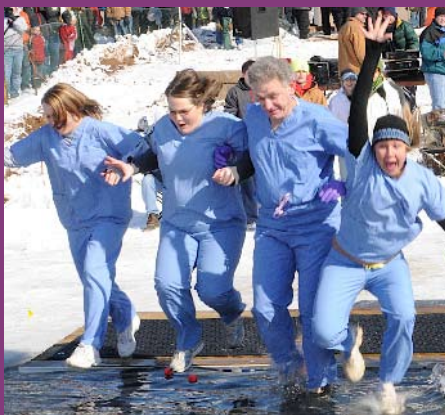
Members of the 2009 "Critical Care Crew"