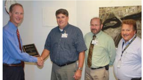
Pictured above: Members of Sacred Heart's Environmental Energy Team accept a plaque from a Xcel Energy representative.

The goal of the hospital's environmental energy team is to assess past progress, current status and set best practice benchmarks for further progress in reducing, reusing, and recycling. The team consists of representatives from both Sacred Heart and St. Joseph's hospitals, Xcel Energy, Focus on Energy, and a representative from Hospital Sisters Health System.