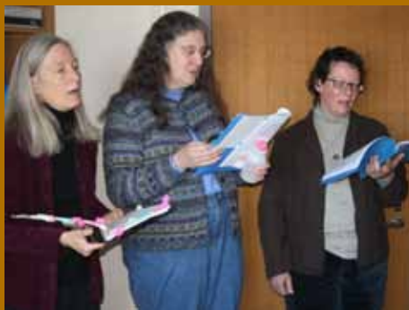
The Threshold Singers performed a musical version of the Prayer of St. Francis on Sacred Heart's 5th Floor.