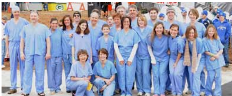
2010 “Critical Care Crew”