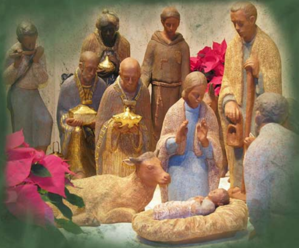
St. Francis of Assisi Church